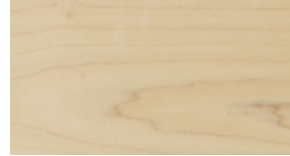
Natural (Knotty Pine Only)