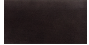
Java (Poplar Only)