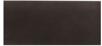
Java (Poplar Only)