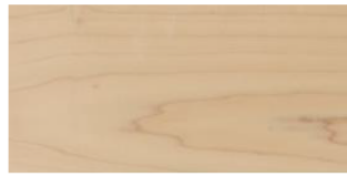
Natural (Knotty Pine Only)